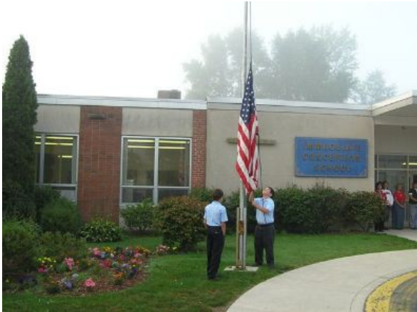
Immaculate Conception School promotes (a/an)